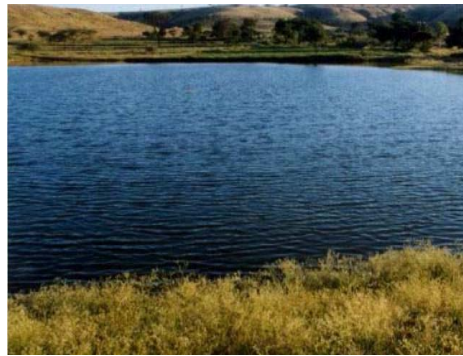
(d) Percolation tank along the drainage line

Plate 6; Few examples of drainage line treatments.